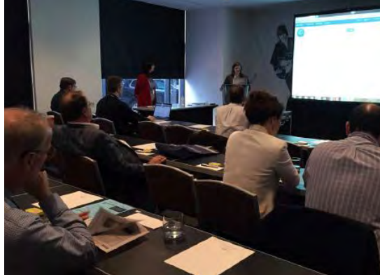
Hosting the Hands-On User Session at AAR & SBL Annual Meetings

In the summer of 2014, ATLA partnered with the Illinois Institute of Technology's Institute of Design (IIT/ID) and 94 Westbound Consulting to conduct the first ethnographic study in ATLA's history focusing on scholars. For this project student researchers worked alongside an Institute of Design professor to conduct human-centered research with ATLA. Through ethnographic studies the students were able to understand digital scholarship from the perspective of workflow, motivations, and goals. In 2015, several members of the research team presented at the ATLA Annual Conference in Denver to share their research process and key insights with attendees.